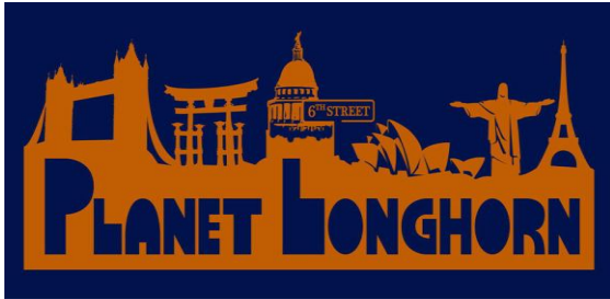
Front of T-shirt