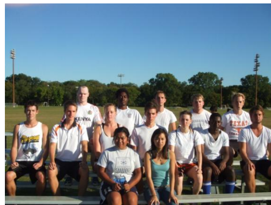
Planet Longhorn IM Soccer Team

The original qualifier for the Coed-C playoffs division from the 3:00pm Sunday timeslot backed out of their first game because all of the team members had an exam during the first game. Their spot in the playoffs was replaced by Planet Longhorn. PL won the first playoff game 3-1 against The Abusement Park, then moved onto the semi-finals and played KUSA, a team full of very fast Koreans. PL lost to KUSA; the score is unimportant. Planet Longhorn played a great season and was ecstatic to have made it so far in the playoffs!